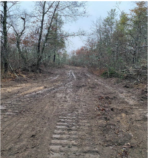
New Eagle's Nest Trap Road - October 2024

On the horizon are the final stages in building the Eagle's Nest Trap. This is the last big step in the sediment control plan for Lake Eau Claire, and one of the most difficult trap areas to access. This trap will help protect the Skid Row boat landing and the Rookery from sediment deposits. It will also reduce cleanouts at Skid Row. The project is out for bids and should be built this winter. A new 1700-foot road was built to access the Eagle's Nest Trap. Haas Sons Inc. won the bid for about $6200, and the road was finished in October.