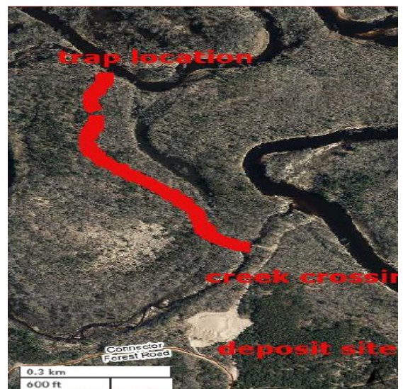
Located behind Gravel Pit Deposit site near the river